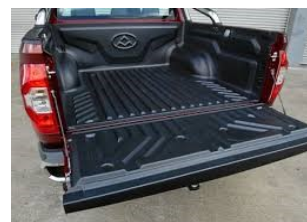
Tub tray ute