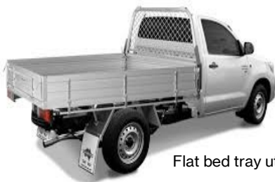
Flat bed tray ute

Ensure your load is properly secured tie downs