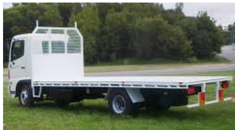
Flat bed/tray truck

If hiring an enclosed truck with rear loading access only. Max 2 pallets can be loaded and you must bring you own heavy duty or hardwood pallets